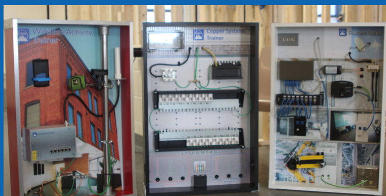
Practical experience is a component of the workforce development programs.

One side benefit of the program has been the fellowship and cohesion of the youth in the class. They learn to work together, cooperate, help each other and enjoy their time together, which makes a work environment positive and productive.