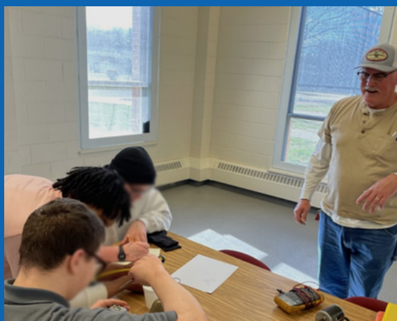
Students work together on projects in the electrical class.